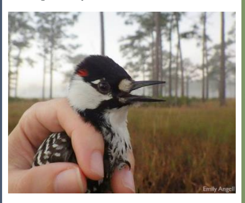
Male Red-cockaded Woodpecker at Avon Park Air Force Range

Biologists from Archbold's Avian Ecology Program traveled to Osceola National Forest in north Florida to bring six Federally Endangered Red-cockaded Woodpeckers (RCWs) back to Avon Park Air Force Range (APAFR). Called 'translocation', moving birds among populations is an essential management tool along with prescribed fire and tree cavity management. Our biologists spent a week assisting US Forest Service staff find where each of the woodpeckers was roosting at night before capturing them at their pine tree cavity. Osceola National Forest is considered a