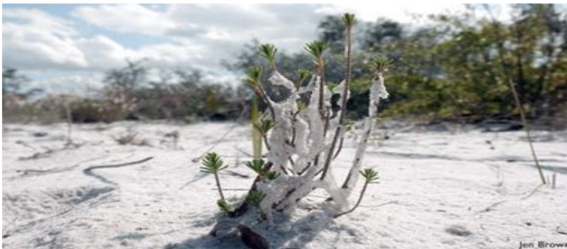
Florida Rosemary seedling in the high elevation scrub at Archbold.