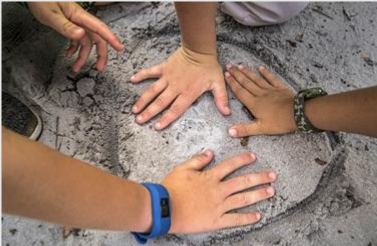
Archbold Ecology Summer Campers compare their hand size to a mammal track last year.

Quarantines, closed summer camps and activities, canceled travel plans, social distancing...parents are all too familiar with the struggle to maintain some normalcy this summer. With children out of school, many are probably a bit stir-crazy. Parents might be wondering what to do with these kids all day. Or maybe you need some activities for yourself. In June, Archbold Biological Station's Virtual Ecology Summer Camp focused on campers doing at-home science projects that use household supplies. Now that all the camp sessions are over, Archbold has made the camp website open to the public. Click here . You can now enjoy the same fun backyard science projects at your own pace. The website includes simple directions, tutorial videos, photos of campers in action, and educational nature videos made by teen camp